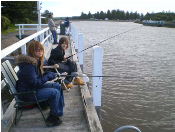
Fishing the Moyne River for trevally

Most of these trips have been to the Moyne River at Port Fairy and we have caught a wide variety of fish including Silver Trevally, King George Whiting, Mullet and Salmon Trout.