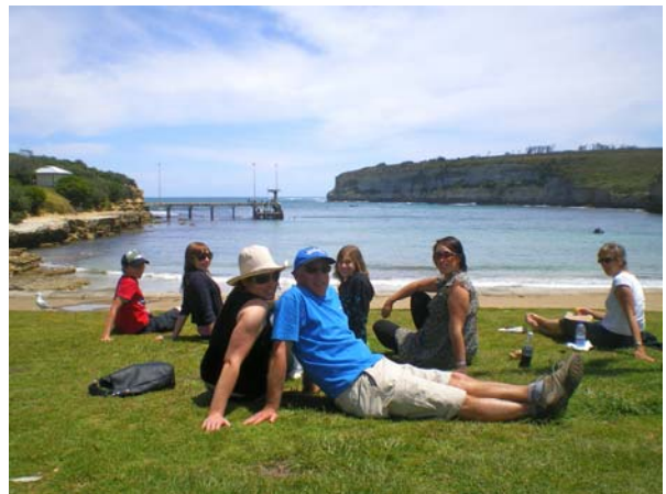
Port Campbell Bay