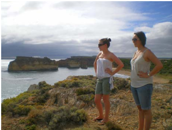
Great views at Sandy Bay/ Childers Cove

This vehicle will enable us to provide personalized tours of between 2-4 people to the more remote parts of the Great Ocean Road and Otway Ranges. We are currently developing a day package The Trail of Pioneers and Shipwrecks focusing on exploring the coastline and Shipwrecks along the Old Coach Road from Princetown to Moonlight Heads.