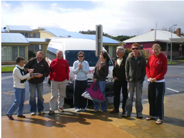
The swimming group warming up after the swim

Swim group to Port Campbell Bay – A social swim followed by lunch at the Timboon Railway shed Distillery.