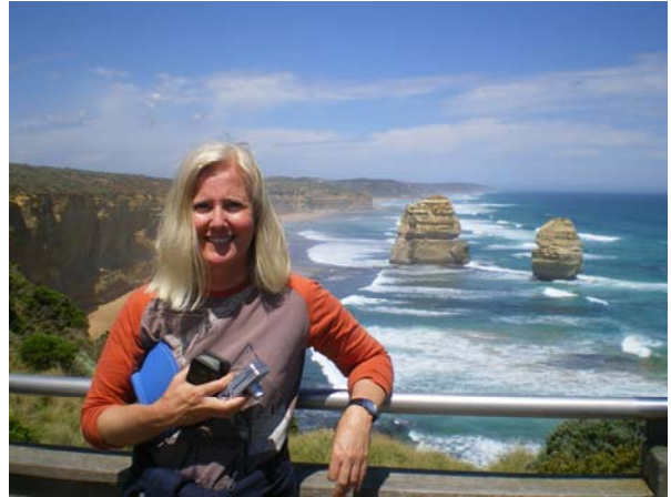
12 Apostles east side