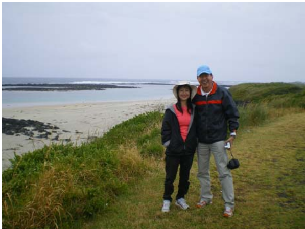
Pea Soup Beach at Port Fairy

By far the most popular tours have been the Half day Port Fairy and Tower Hill explorer and the Day Tour to the Shipwreck Coast and 12 Apostles. This day tour has expanded to include a number of other areas of interest including local cheese manufacturers and winery.