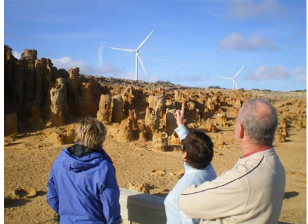
Wind farm at Petrified Forest Bridgewater Bay

We have had tours to all other areas including the wildflowers in the Grampians, Portland & Bridgewater Bay and surrounding areas of interest.