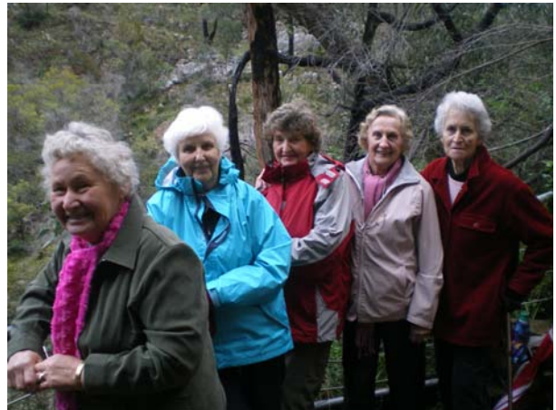
Wildflower tour to Halls Gap