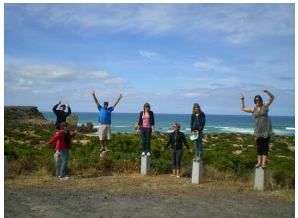
Sandy Bay near Childers Cove